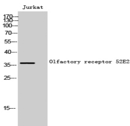
Western Blot analysis of Jurkat cells using Olfactory receptor 52E2 Polyclonal Antibody